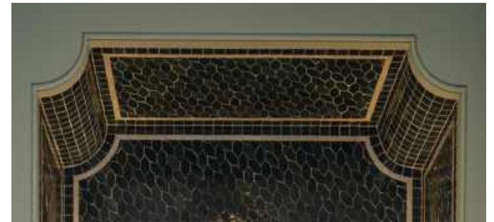
Moroccan Handmade Mosaic Tiles