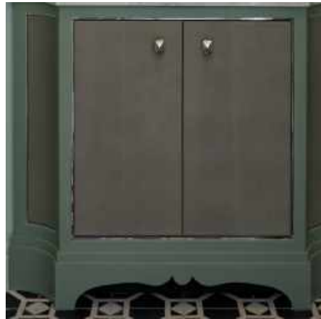
Metal inlaid with Shagreen