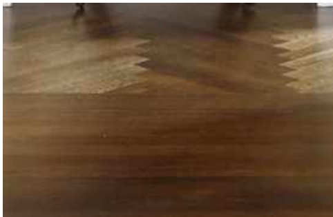
Walnut Stained White Oak Floors