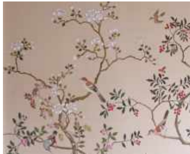
Hand-drawn Wallpaper by Gracie