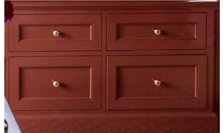
Field painted millwork