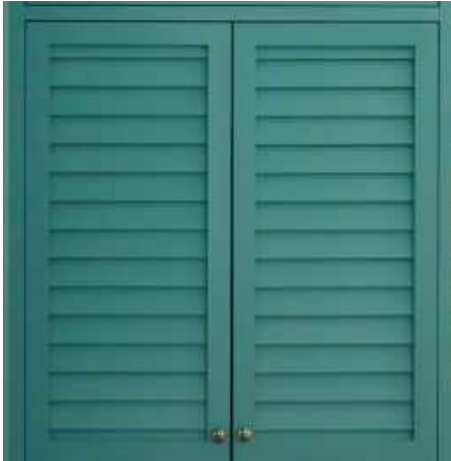
Field painted millwork