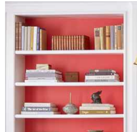
Field painted millwork