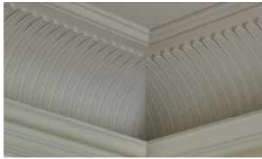
Custom Plaster Mouldings