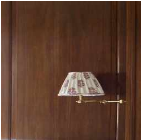
French Polished Walnut