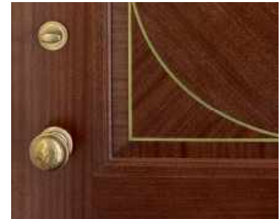
Mahogany with Brass Inlay